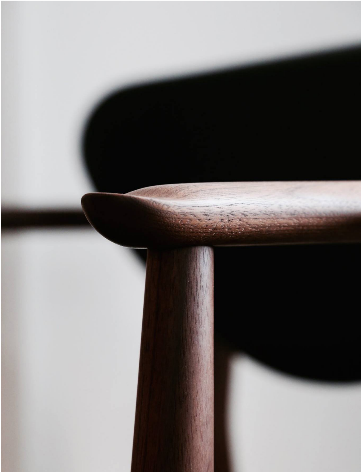
109 CHAIR 1946 BY FINN JUHL